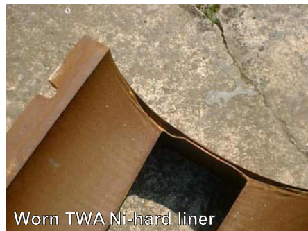
Worn TWA Ni-hard liner

However, this still is not enough for customers handling very abrasive products where a standard valve lasts a matter of days and a TWA, even with its abrasion resistant components, lasts only a few weeks.