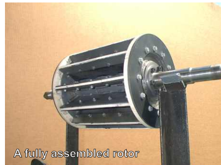
A fully assembled rotor

The TWA is then assembled, using the adjustable design to ensure the clearance between the rotor and the liner is tightly controlled.