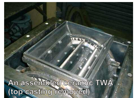
An assembled ceramic TWA (top casting removed)

When combined with MID's mechanical shaft seal technology (and we would not sell an abrasion resistant valve without these fitted) the TWA extreme duty ceramic lined rotary valve is the ultimate in rotary valve technology for abrasion resistance.