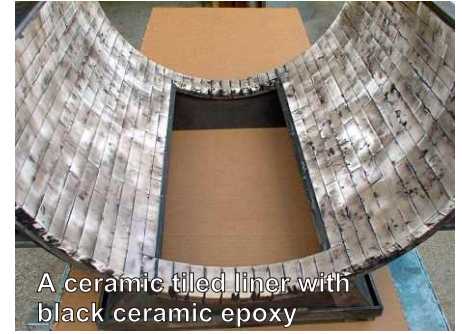
A ceramic tiled liner with black ceramic epoxy

new set installed and ground and the valve returned as good as new, all for less than the price of a standard rotary valve of an equivalent size. The advantage is obvious- the lifetime cost