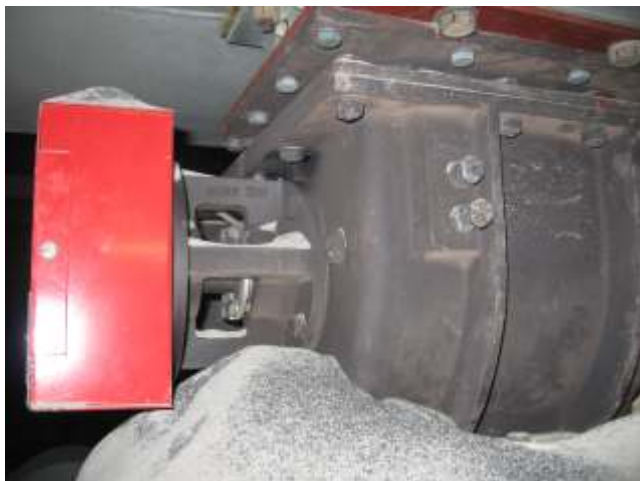
Rotary valve with leaking shaft seals

There is no regular maintenance, downtime or re-packing required so plant maintains a much better uptime record, dramatically reducing production losses and increasing profitability.